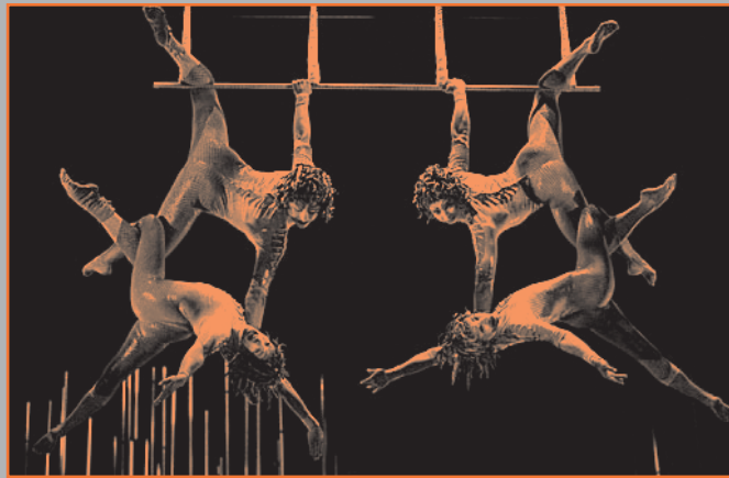
Cirque De Soleil's trademark acrobatics are now being performed using WireCo WorldGroup's Union brand XLT 4 .

diameter rope could offer a broad array of applications meeting numerous rigging needs throughout the entire show. After extensive testing of the XLT 4 product in numerous acts within the performance, the Cirque De Soleil officials sealed the deal to include XLT 4 in their rigging requirements.