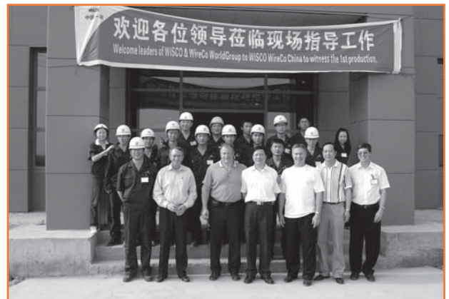
Pictured above: Wuhan Iron and Steel Company officials and WireCo WorldGroup Officers are joined by several manufacturing employees during the opening week of operations at the Joint Venture in Wuhan, China.

To be the largest wire rope manufacturer in the world requires a facility on an equally grand scale. The architectural firm of HJM Architects Inc., who has extensive industrial design experience throughout China, designed the complex which was built by Blue Scope - owner of Butler Buildings. The 23-acre building required 16,000 pilings and has an incredible 37,000 cubic meters of concrete in the slab. The finished 900 foot-wide building has a 50 foot center ridge and a standing seam roof.