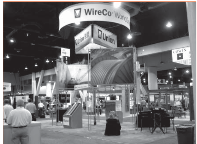
Pictured above is the WireCo® WorldGroup exhibit from the 2008 MINExpo in Las Vegas.