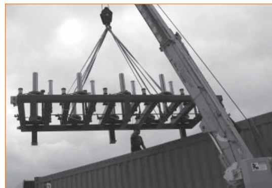
A crane was used to remove the buncher components from the four containers delivered to Rosenberg.