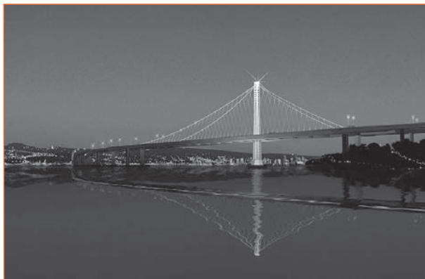
Pictured above is a rendering of the proposed San Francisco Oakland Bay Bridge

The wire rope suspenders and cables that WireCo® WorldGroup will engineer for this project include 75mm and 90mm wire rope suspension hangers, which connect the floating bridge box girders and the tower. As a result, the SAS will be the first suspension bridge engineered to require no connection between the tower and the deck. In addition, the company will supply the hand rope assemblies that allow access to the 2.56-foot diameter main cable. WireCo® WorldGroup's proven quality record and reputation was critical to this contract award where there can be no compromise in the engineering and manufacturing of precise lengths and tolerances, and the equally important critical delivery schedules.