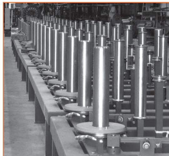
One section of the 'payoff' awaits to be installed with the 1250 buncher.