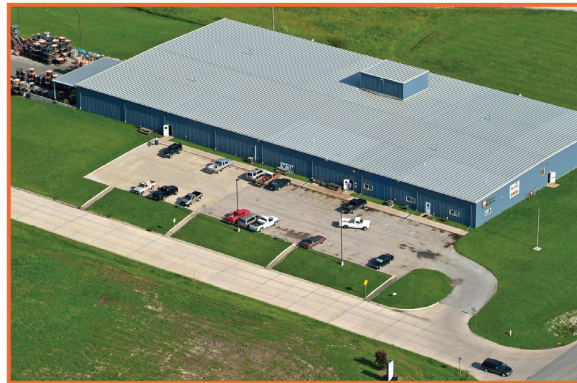
The Kirksville manufacturing plant, located in Kirksville, Mo., is renowned for its ability to manufacture unique fabricated products and small diameter wire rope products.