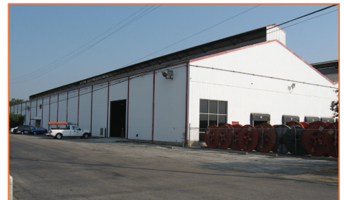
Houston Distribution Center 5301 Polk, Bldg 11 Houston, Tx 77023 +1 (713) 675-6511

The center also has the capability to load containers for export to our international customers.